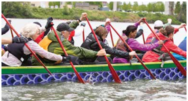
Lethally Blind paddling in sync for their upcoming race.

Dragon boating is one of the fastest growing water sports in the world. Locally, it’s making a difference for a team of paddlers one person, with a desire to move the boat and life forward, at a time.