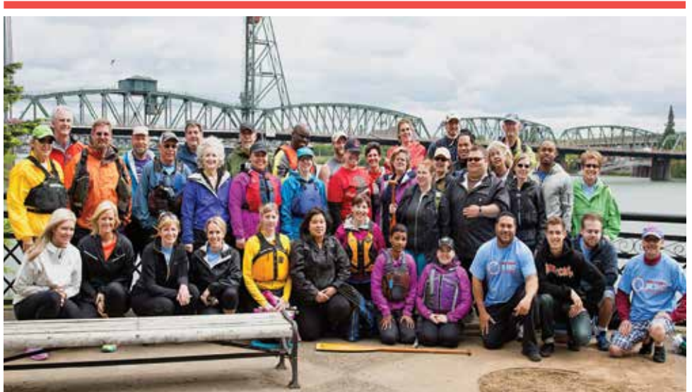
NWABA Board Members recently had the opportunity to go Dragon Boating with the Team