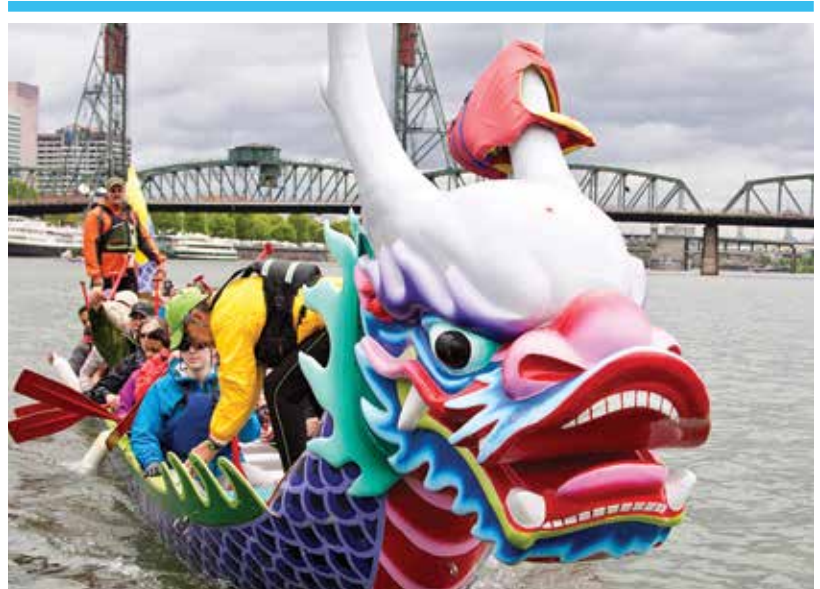
Athletes training for the Portland Rose Festival Dragon Boat Races