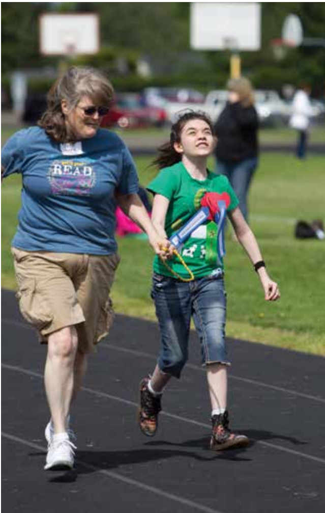
Student experiencing the joy of running with the help of a guide.

Northwest Association for Blind Athletes is excited to announce the creation of the Champions Legacy Giving Society to recognize individuals who have chosen to support the organization through a planned gift. Your membership in the Society will ensure that individuals who are blind or visually impaired will always have the opportunity to build confidence and self-esteem through participation in